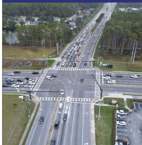
CR 210 at CR 2209 Intersection