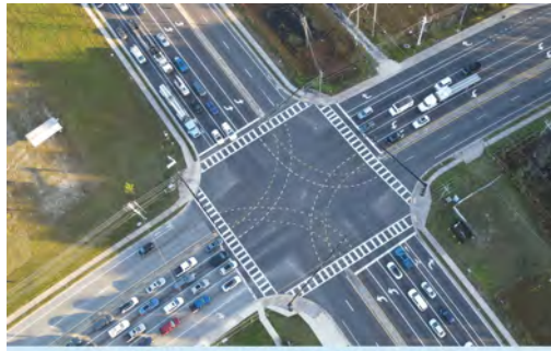
CR 210 at CR 2209 Intersection

Access management improves safety by reducing the number of potential conflict points for users of the transportation network, thereby lowering the risk of crashes.