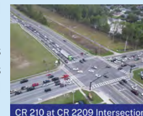
CR 210 at CR 2209 Intersection

The proposed improvements will change how motorists navigate the intersection and access adjacent businesses.