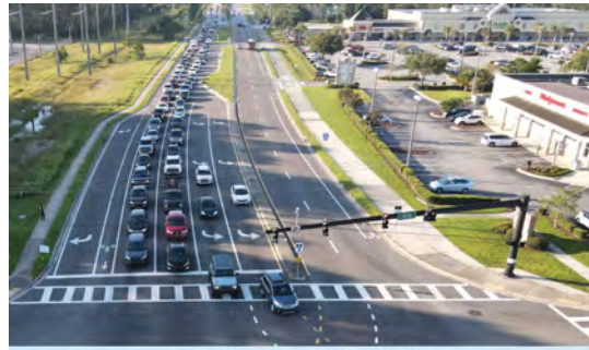
Traffic along CR 2209